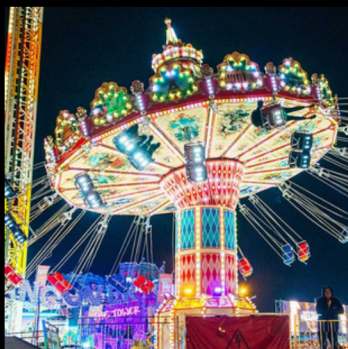
WINTER WONDERLAND IN HYDE PARK UNTIL 1ST JANUARY 2024

The annual favourite is back for its sixteenth year in 2023. Head to Winter Wonderland in Hyde Park for cheerily lit fairground rides, a child-friendly Santa Land (including Santa's grotto) and quaint Christmas markets. It's a real treat for anyone wanting to get into the festive spirit!