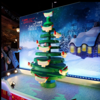
IMMERSIVE LEGO ADVENTURE UNTIL 3RD JANUARY 2024

Enjoy the delightful show 'Backstairs Billy' in Covent Garden. See Penelope Wilton and Luke Evans star in this new regal comedy at the Duke of York Theatre, located opposite St Martins Lane London. Discover the story behind one of the Royal Family's most well-known and devoted servants – William Tallon.