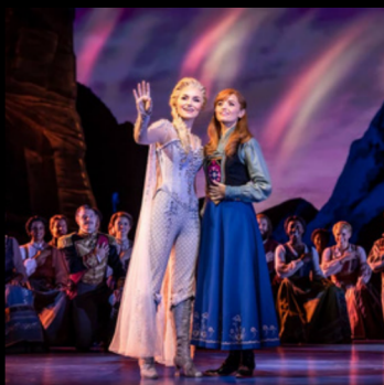
DISNEY SHOWS ON THE PIAZZA THROUGHOUT DECEMBER 2023

An immersive LEGO adventure will return to the Piazza for the second year running from 1st December until 3rd January, accompanied by a LEGO Christmas shop. This free experience will include a rocket race car, firefighting dragon, princess racing driver and a cactus Xmas tree all made out of LEGO bricks.