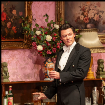
BACKSTAIRS BILLY AT THE DUKE OF YORK'S THEATRE UNTIL 27TH JANUARY

Enjoy the delightful show 'Backstairs Billy' in Covent Garden. See Penelope Wilton and Luke Evans star in this new regal comedy at the Duke of York Theatre, located opposite St Martins Lane London. Discover the story behind one of the Royal Family's most well-known and devoted servants – William Tallon.