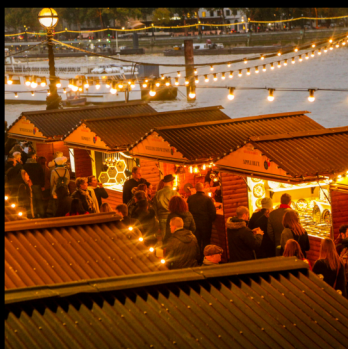
SOUTHBANK CENTRE WINTER MARKET UNTIL 26TH DECEMBER 2023

The Young Vic revives 'The Homecoming' as its Christmas show this year. First staged in 1965, Pinter's cryptic masterpiece concerns the return of Teddy to his unruly, all-male family's north London nest, six years after he went away to teach in America. He's brought his wife, Ruth, and their marriage rapidly unravels in a bizarre, haunting psychodrama. Directed by Jamie Lloyd, so expect something pretty special.